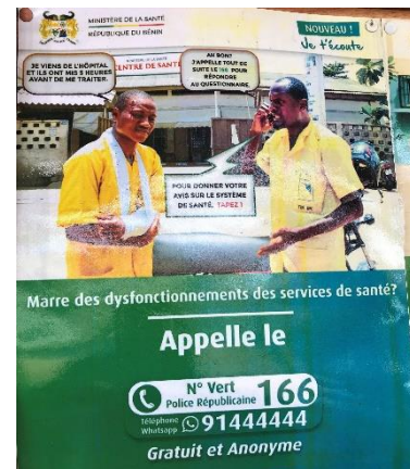
Figure 4 Poster depicting the hotline service for feedback on health services