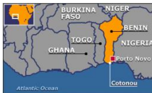
Figure 1 Map of Benin

Benin is a geographically small country (114,763 square kilometers), nestled between Nigeria, Niger, Burkina Faso, and Togo on the West Coast of Africa (see Figure 1 Map of Benin). The World Bank estimates the total population of Benin to be at 11,485,098 as at 2018. It achieved independence from France in 1960 and includes a multitude of ethnic and linguistic groups 1 .